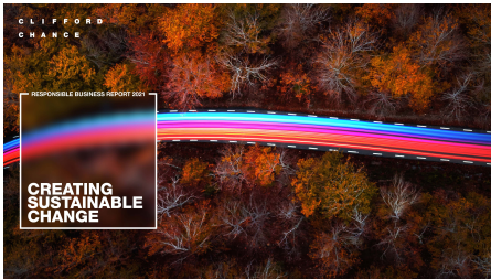
Read our Responsible Business Report 2021